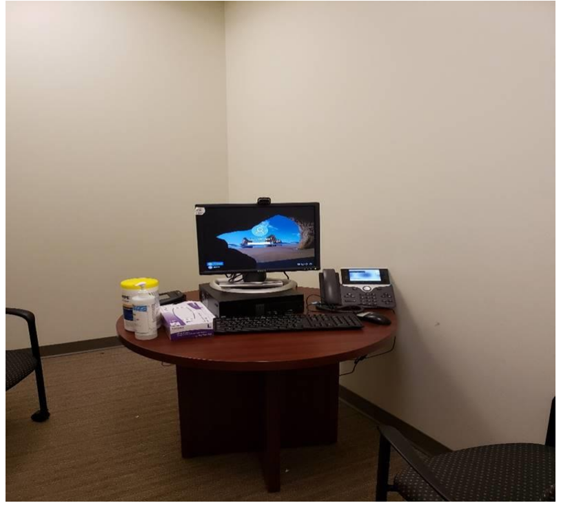
Bergen County Courthouse technology room