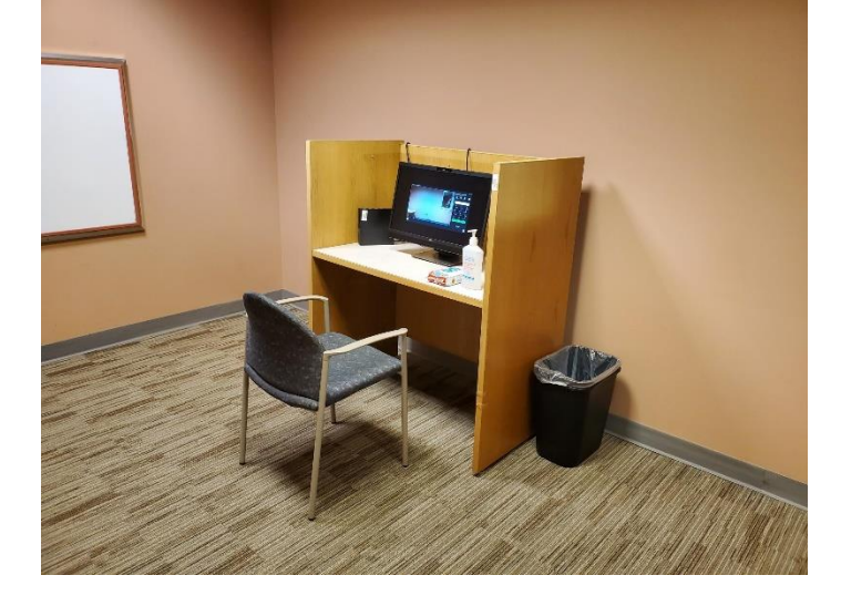
Hunterdon County Courthouse technology room